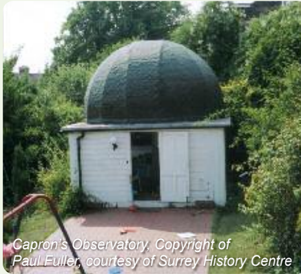
Capron's Observatory