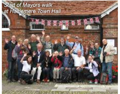
Start of Mayors walk at Haslemere Town Hall