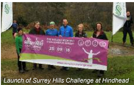
Launch of Surrey Hills Challenge at Hindhead

The Surrey Hills Challenge is set to be one of the biggest sporting challenges in Surrey this year with a series of running and