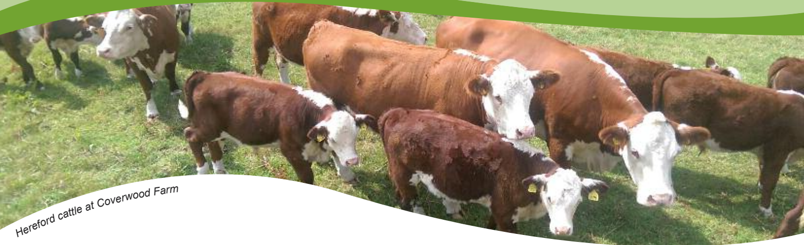
Hereford cattle at Coverwood Farm