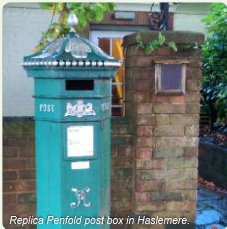
Replica Penfold post box in Haslemere.

Throughout the centuries, Surrey folk have been inventive and creative people. A number of them had ideas which drove progress or had far reaching implications. In this feature, we highlight just six of them from the 19th and 20th Century – although, space permitting, we could have included many more.