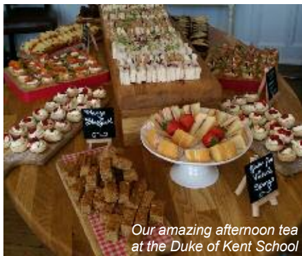
Our amazing afternoon tea at the Duke of Kent School