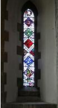
Medieval glass in St Mary's church, Chiddingfold

industry as early as 1226. During the reign of Elizabeth I, there were no fewer than eleven glass works on the green. Chiddingfold glass was used in some of the finest buildings in the land, including St Stephen's Chapel, Westminster, and St George's Chapel, Windsor. It is suggested that the works were suppressed during the reign of Elizabeth I on the petition of the inhabitants that they were causing a nuisance. However, this action was probably due largely to the unpopularity of the foreigners (French, Flemings and Germans from Lorraine) who owned these furnaces.