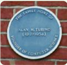
Plaque outside Turing's parents home in Guildford

mathematically focussed education and when she was subsequently introduced to Charles Babbage and his "Analytical Engine", something clicked. She foresaw how such machines could undertake far more complex tasks than those Babbage focussed on and started to develop ideas which are now considered to form the birth of computer science.