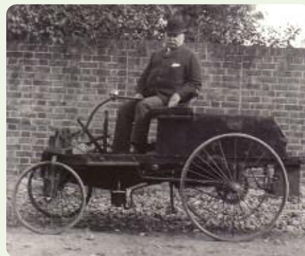
Knight on one of his early cars

was designed very much as an experiment in order to attract Police attention and therefore create public awareness of the